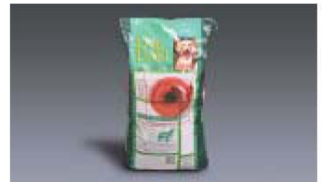
Attachment of Premiums Fig.186 The use of the shipping container as a marketing and merchandising vehicle is a cost effective way to reach end-users. Scotch® Custom Printed Pouch Tape 828CP and ScotchPad™ Custom Printed Pouch Tape Pads 830CP can be used to attach product samples, merchandise, premiums, literature, catalogs, or brochures.