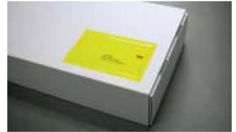
Label Attachment and Protection Fig.183 Scotch® Britegard™ Film Tape 823 is a bright yellow highlighting film tape. The bright yellow color directs your eye right to the label. It is the best choice for protection of the print on carbonless labels.