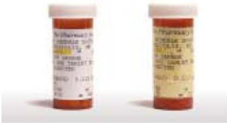
Prescription Label Protection Fig.181 Scotch® Prescription Label Tape 800 is designed to protect and enhance prescription labels. It guards against abrasion, moisture, smudging and fading. It has very easy unwind and excellent dispensability.