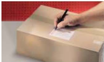
Write-On Surface/Electronically Scannable Fig.185 If labels are to be electronically scanned or if they need to be edited after application, Scotch® Labelgard™ Film Tape 821 is the choice. The matte finish pink acetate film backing provides a smooth write-on surface and eliminates glare so bar codes can be scanned from a distance.