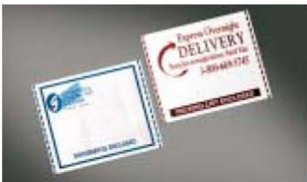
Custom Printed Messages Fig.187 Scotch® Custom Printed Pouch Tape 828CP is a pressure sensitive tape with a non-tacky, see-through window. It can be pre-printed with a company logo or custom message. It is available in a variety of border colors and print styles in multiple sizes.