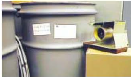
Outdoor/Harsh Environment Fig.182 Scotch® Polyester Film Tape 356, with a rugged polyester backing and long-aging adhesive, has excellent water, abrasion, UV and chemical resistance. It is an ideal choice for protection of labels in harsh or outdoor environments.