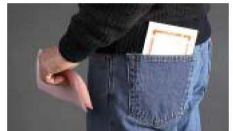
Versatility Fig.189 ScotchPad™ Pouch Tape Pad 830 is the same product as Scotch® Pouch Tape 824, but in an easy-to-use pad form. No dispenser is needed. Tape pads are compact and portable and ready to use at any time.