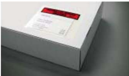
Document Control Fig.184 3M™ Packing List Envelopes offer high quality printing to focus attention on your documents and a high tack, hot melt adhesive that keeps envelope in place through a wide range of temperatures and conditions.