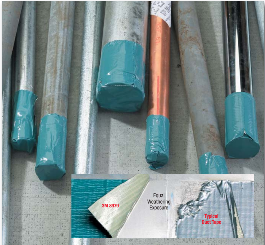
For temporary capping of pipes or conduit, 3M™ Performance Plus Duct Tapes 8979 and 8979N conform and adhere to metal and plastic. Strong backing keeps out water and dirt for up to a year even in outdoor storage.