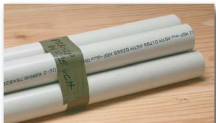
For bundling a wide variety of items, 3M™ Duct Tapes with natural rubber adhesive and high tensile strength backings adhere on contact and hold securely.