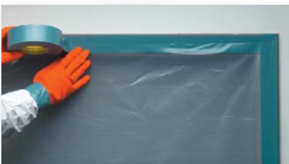
For a tight seal in many containment situations, 3M™ Performance Plus Duct Tape 8979 attaches heavy poly draping, closes cuffs, and then removes cleanly when the job is finished.