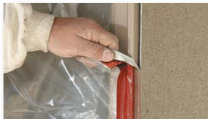
Strong backing of 3M™ Outdoor Masking and Stucco Tape 5959 pulls through stucco, EIFS, and other heavy coatings in one piece.