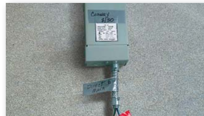
Write on the surfaces of many 3M™ Duct Tapes with pen or marker to leave a reminder or mark and identify works-in-progress, components, items bundled, and more.