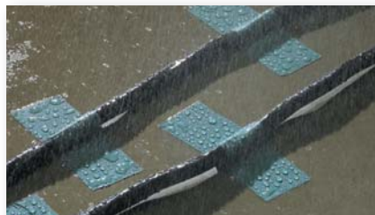
Waterproof backing of 3M™ Performance Plus Duct Tape 8979 resists moisture and rain for up to a year.